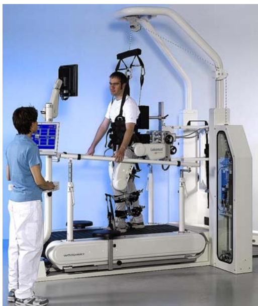
The Robotic Orthosis Lokomat

In this project, software is developed and clinically validated to train and assess the physiological and neurological status of the patients. The robot can now be used to measure spasticity (i.e. pathological increased muscle tone), isometric voluntary muscle force and range of motion; which are factors possibly affected by the neurological injury. These new tools will provide a standardized, easy-to-use method for documenting rehabilitation progress by robot-assisted quantitative measurement. It should therefore improve training quality and deliver better documentation for “management-by-objectives” rehabilitation, as well as reporting to insurances.